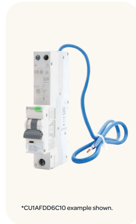
*CU1AFDD6C10 example shown.