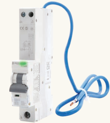
*CU1AFMCB6B10 example shown.